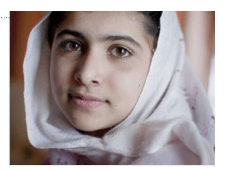
Malala Yousafzai, Nobel Peace Prize Winner

on the escalation of attacks against girls' education